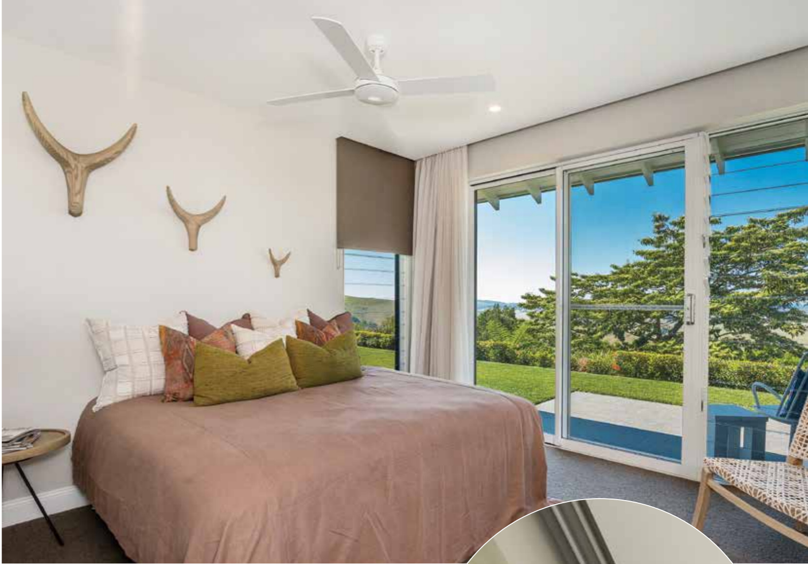
Behind the scenes >