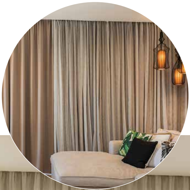
< With the curtains closed

The key curtain fabric was Gummerson Fabrics’ Summer Sheer in Multi Silver, hung on a standard aluminium rail in white. Summer Sheers combines the latest decorative shades with a superb dry natural textured continuous sheer. The range is also practical; 100% easy care, 295cm wide, yarn dyed polyester with the additional benefit of a weighted base, which allows for a clean contemporary finish in a seam free continuous furnishing. The beauty of the Summer Sheers collection is the use of an irregular fine slub yarn that creates a wonderful natural finish and permits a soft filtered light to enter a room. The sheers have also been tested for Flame Retardancy to AS1530 Part 2 and may be suitable for a variety of commercial applications or for peace of mind in any residential interiors. Curtains were lined with Nettex Nightrider Natural triple weave.